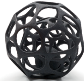
Picture taken after dye post-processing